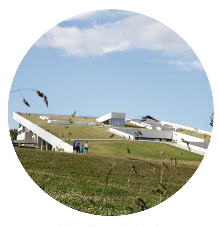
© Moesgaard Museum (2013) - Henning Larsen Architects. Photo by Kim Wyon